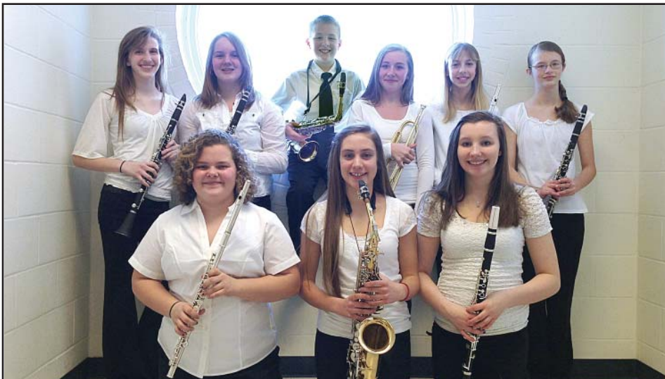
Junior High Band