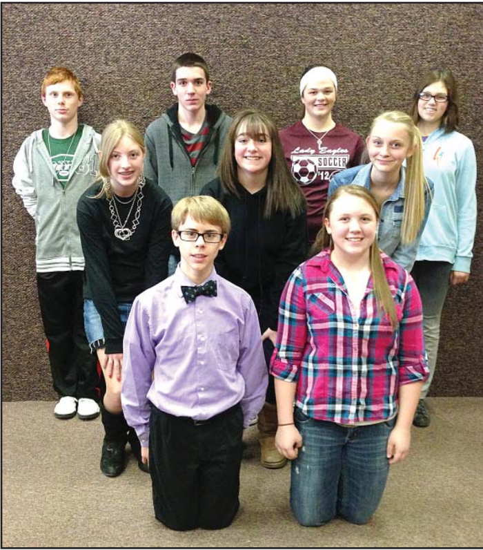
Junior High Chorus