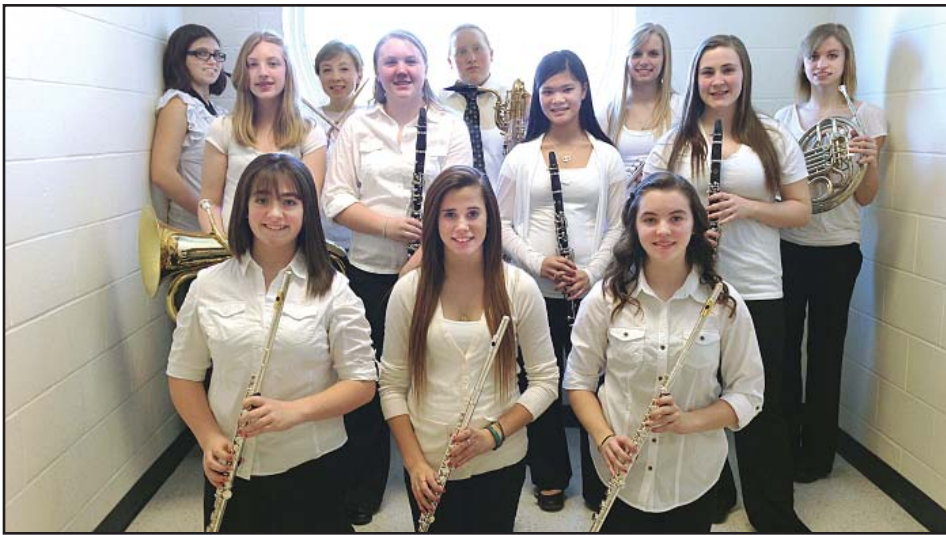
Senior High Band