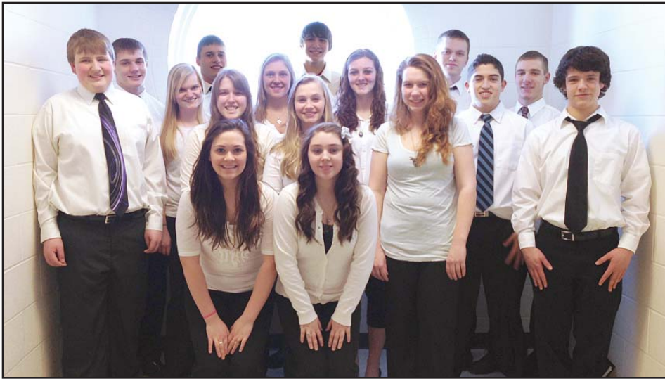
Senior High Chorus